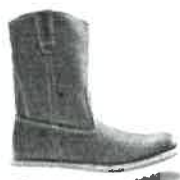
10" Tan W08285 Soft-Toe