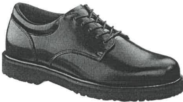
E22233 - BLACK M 4-12,13,14,15,16,17 W 7-12,13,14,15