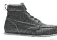
6" Tan - WPF W10840 Steel-Toe W10841 Soft-Toe