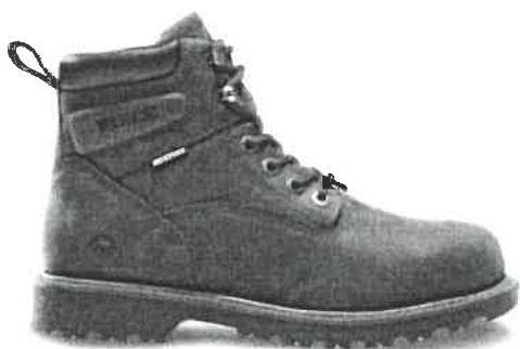
6" Dark Brown W10633 Steel-Toe BEST SELLER W10643 Soft-Toe

TOE TYPE: Steel-Toe or Soft-Toe UPPER: Premium Waterproof Full-Grain Leather LINING: Breathable Waterproof Membrane with Moisture Wicking Mesh INSULATED: N/A FOOTBED: Removable Full-Cushion Molded EVA MIDSOLE: Rubber OUTSOLE: Rubber Lug CONSTRUCTION: BonWelt SHANK: Nylon RATING: ASTM F2413-18 M I/75 C/75 EH SIZING: Men's: M 7-12, 13, 14; EW 7-12, 13 Women's: M 5-10, 11; W 5-10 6-WB0525/0005, 10-WB0595/W0575