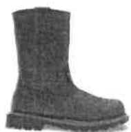
10" Dark Brown W10680 Steel-Toe W10682 Soft-Toe