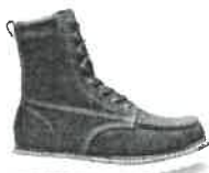
8" Brown W10741 Steel-Toe