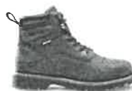
6" Dark Brown - Women's W10696 Steel-Toe