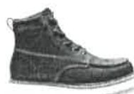
6" Brown W10744 Soft-Toe