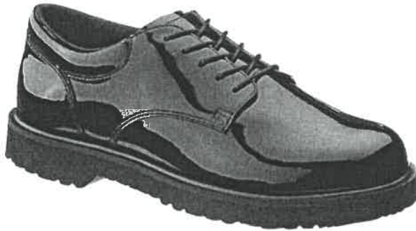
E22141 - BLACK M 7-12,13,14,15,16,17 W 7-12,13,14,15