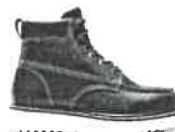
6" Black W08152 Steel-Toe W08151 Soft-Toe