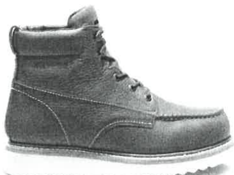
6" Tan W08289 Steel-Toe W08288 Soft-Toe

TOE TYPE: Steel-Toe or Soft-Toe UPPER: Full-Grain leather LINING: Unlined INSULATED: N/A FOOTBED: Removable Full-Cushion MIDSOLE: N/A OUTSOLE: PU wedge CONSTRUCTION: Goodyear™ Welt SHANK: Nylon RATING: ASTM F2413-18 M I/75 C/75 EH SIZING: M 7-12, 13, 14; EW 7-12, 13 6-WB0517/0096, 10-WB0517 6-WB0526, 8-WB0576/0056