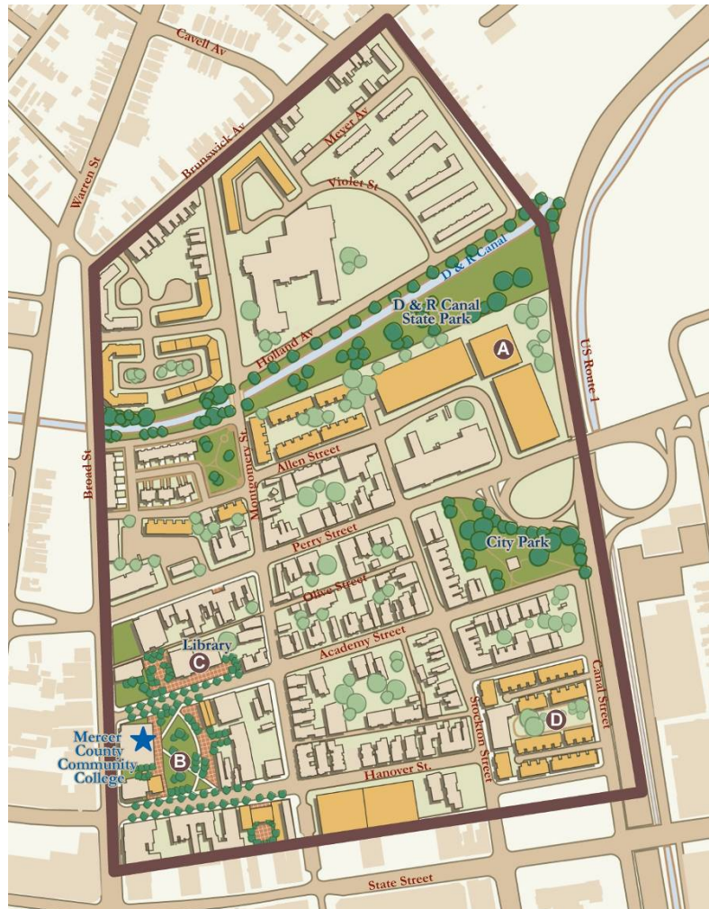
Opportunity sites are depicted in orange. Key sites and projects are keyed to the text that follows.