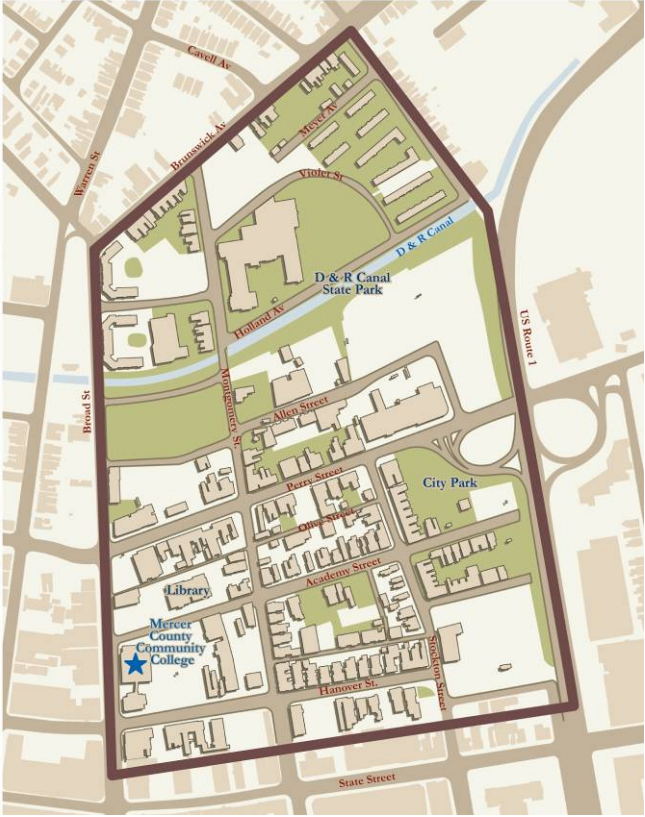
Current Configuration - The majority of the building stock in this historic neighborhood is intact though in various stages of repair. The district contains anchors including Mercer County Community College and the Trenton Free Public Library.