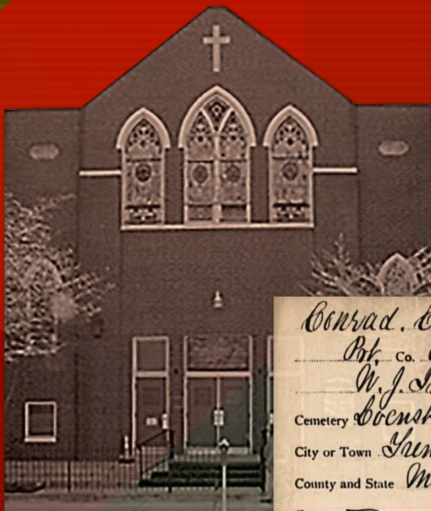
Erected in 1876, this was the main A.M.E. Mount Zion church in Trenton and its congregation established the cemetery on Locust Hill. An earlier church, dating from 1819, enlarged in 1858, occupied this same site.